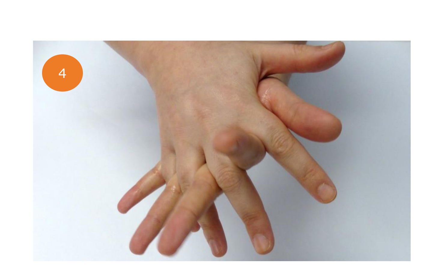
... palm to palm with fingers interlaced ...