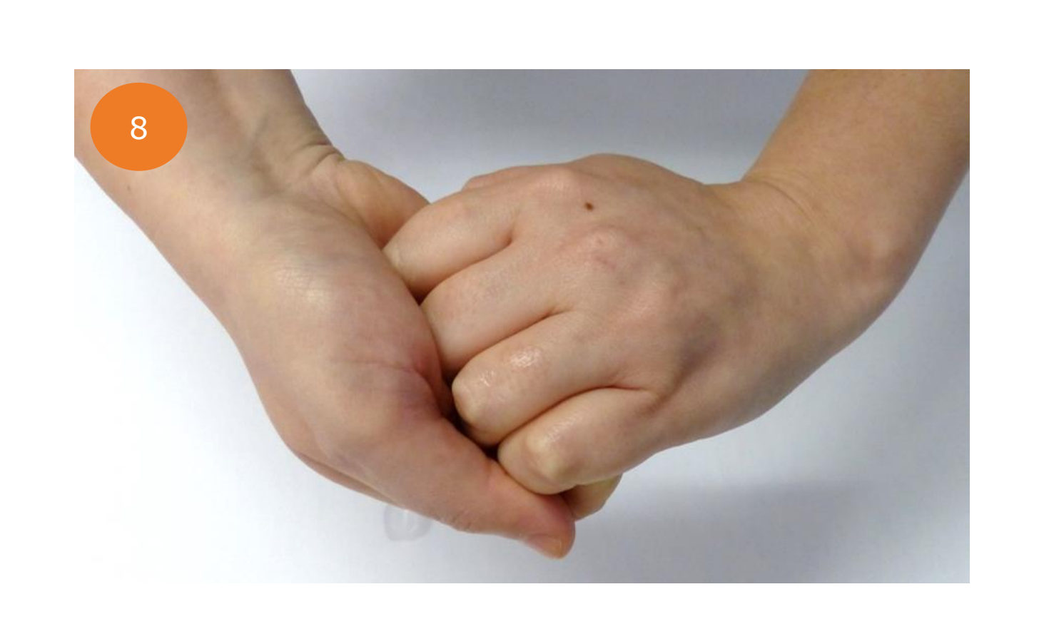
... and vice versa