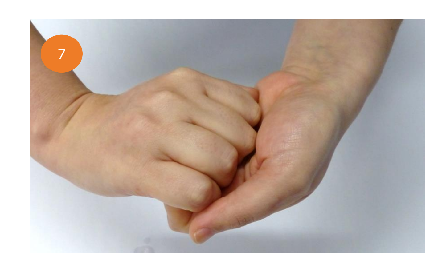
... backs of fingers to opposing palms with fingers interlocked ...