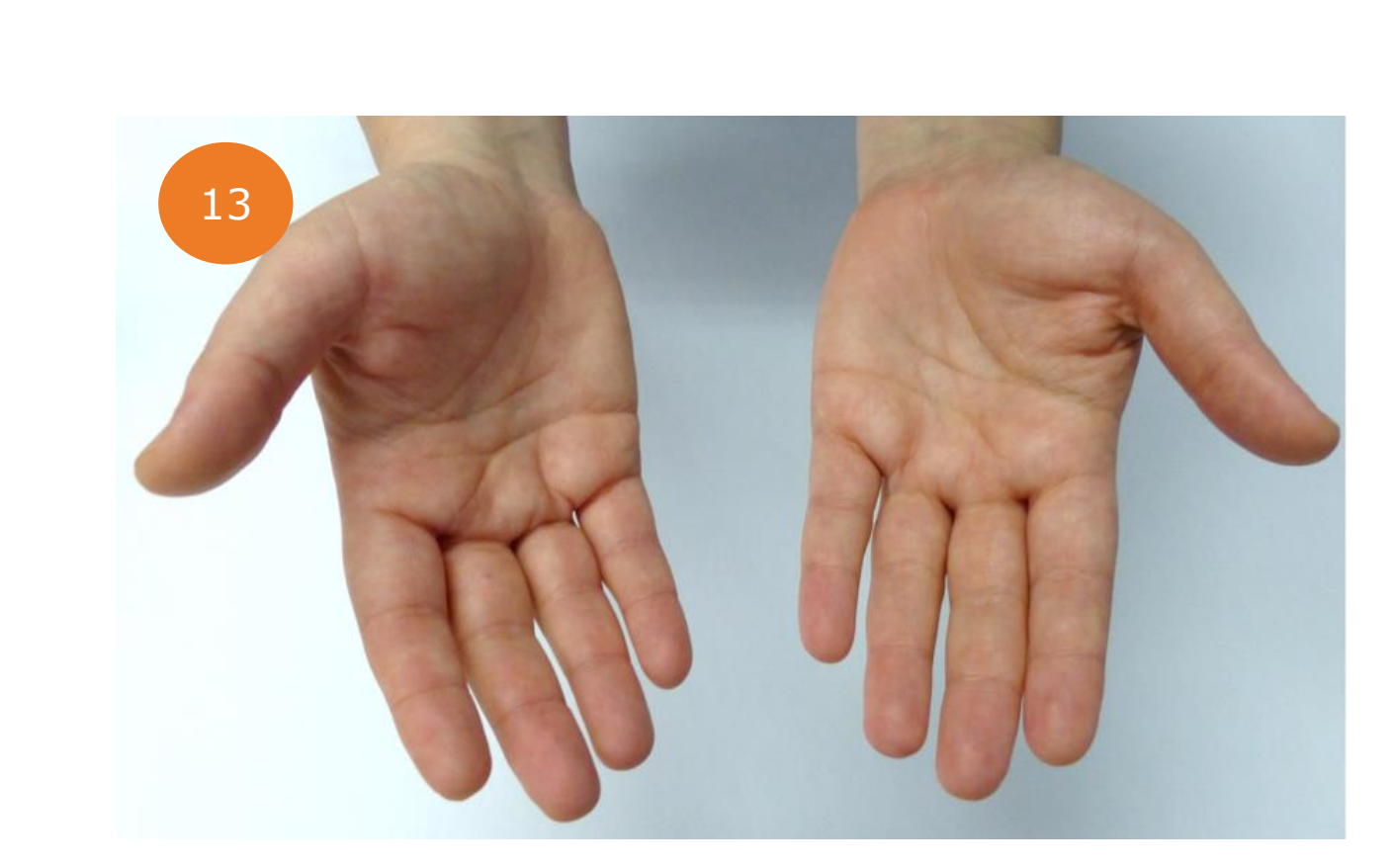
And your hands are safe.