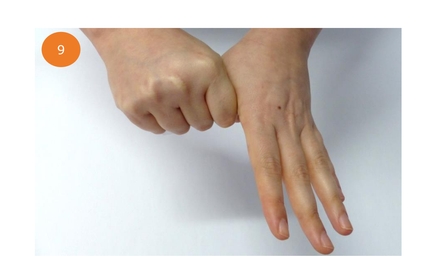
... rotational rubbing of left thumb clasped in right palm...