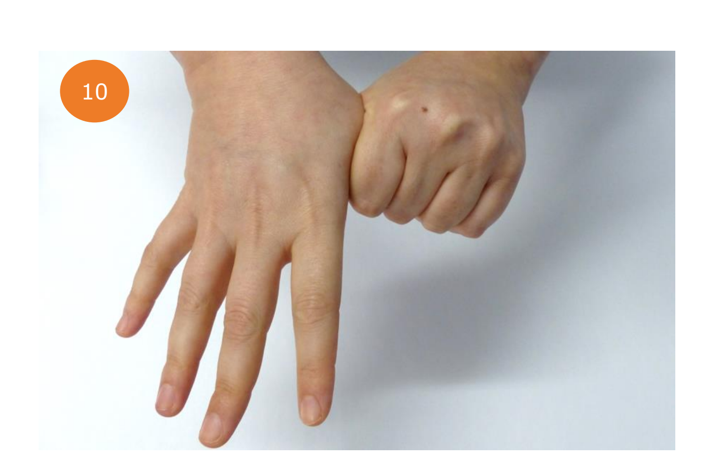
... and vice versa