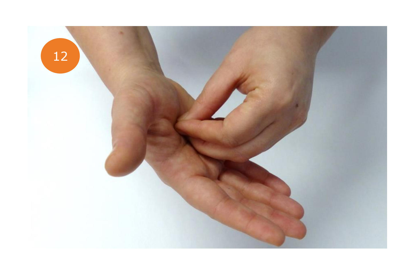
... and vice versa