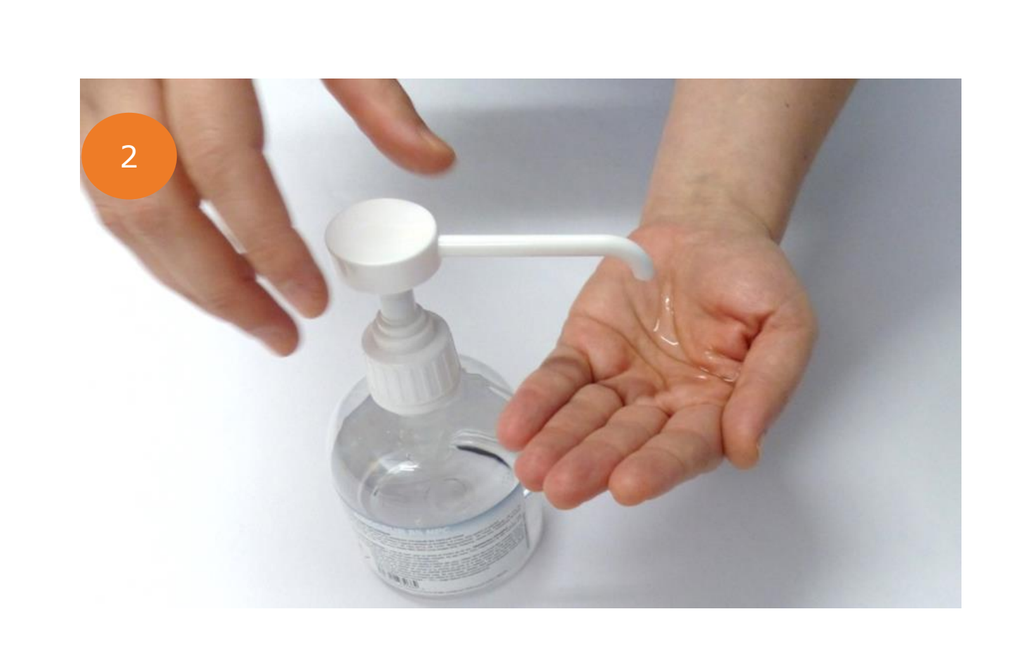
...and cover all surfaces.