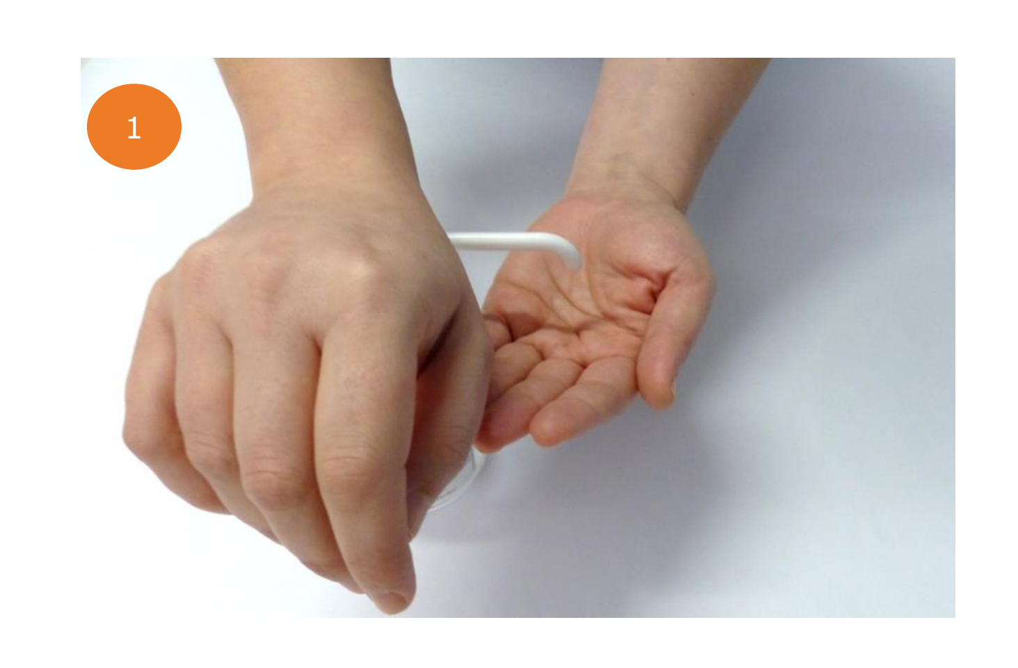
Apply a palmful of the product in a cupped hand ...

Duration of the entire procedure: 20-30 sec.