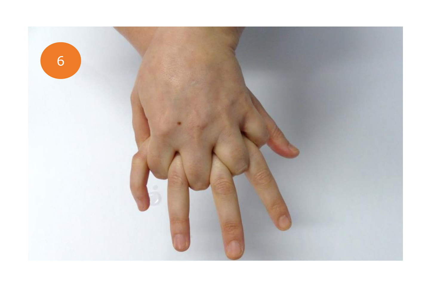
... and vice versa